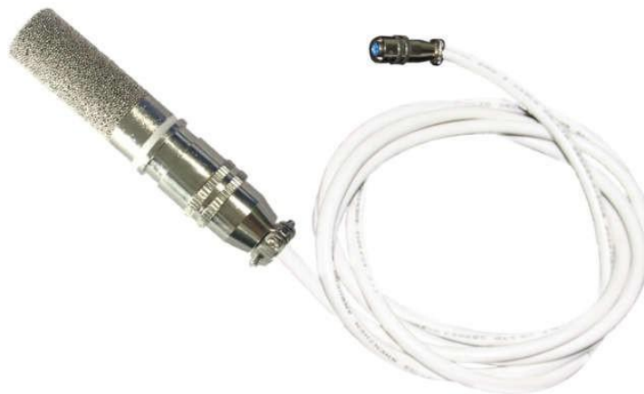
Temperature and humidity sensor